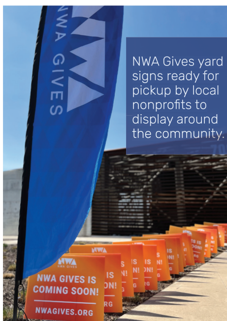
NWA Gives yard signs ready for pickup by local nonprofits to display around the community.

So friends, let's continue to do what our Methodist "father," John Wesley, encouraged: Do all the good you can, By all the means you can, In all the ways you can, In all the places you can, At all the times you can, To all the people you can, As long as ever you can.