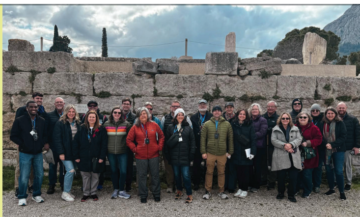
Members of the MFA international cohort that journeyed together in February explored Greece and Turkey through the lens of the Apostle Paul's travels in the region.

The MFA cohort that traveled to Turkey and Greece in February to follow in the Apostle Paul's footsteps included 15 pastors from around Arkansas. Their visits to these sites provided context for the story of how the Good News of Jesus Christ spread to Europe and beyond.