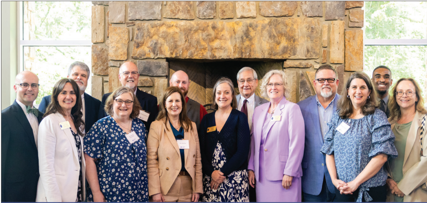
Members of the Journeys of Paul Cohort who traveled together to Greece and Turkey earlier this year attended the 2025 Bishops' Club gathering at Camp Aldersgate.